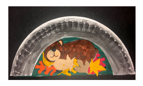
Sleep well bear!

8. Decorate the inside and outside of your bear cave with leaves you've collected from outside or make some out of paper.